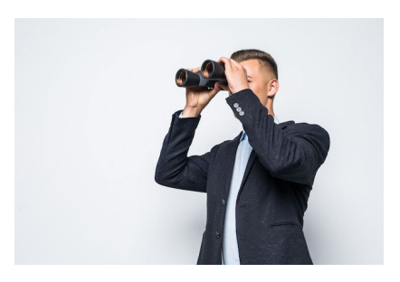
FFGCoP Feb. 2024