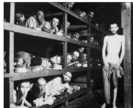
The barracks at Buchenwald photographed just after the liberation of the camp on April 16, 1945. Wiesel is seventh from the left in the center bunk, next to the vertical beam.

What is a witness if not someone who has a tale to tell and lives only with one haunting desire: to tell it. Without memory, there is no culture. Without memory, there would be no civilization, no society, no future.